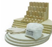
Furniture kit for a J236V.