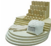
Furniture kit for a J245V.