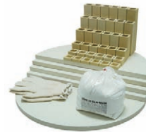
Furniture kit for a J23V.

For all dimensions and weights: See hotkilns.com/jupiter-dimensions.pdf