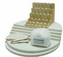
Furniture kit for a J230V.