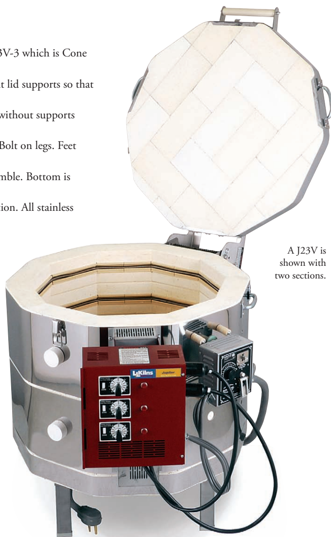
A J23V is shown with two sections.

UL Listing: c-MET-us listed to UL499 standards.