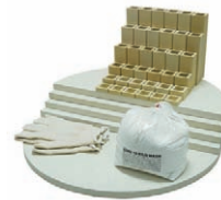
Furniture kit for a J23V-3.

For all Dimensions and Weights: See hotkilns.com/jupiter-dimensions.pdf