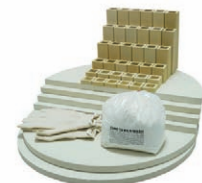
Furniture kit for a J230V-3.