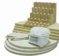
Furniture kit for a J236V-3.