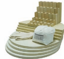
Furniture kit for a J245V-3.