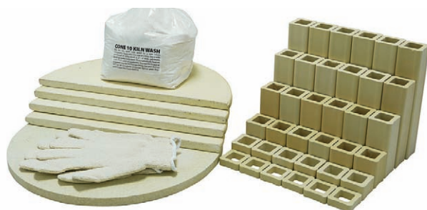
Furniture kit for a J18.

For all Dimensions and Weights: See hotkilns.com/jupiter-dimensions.pdf