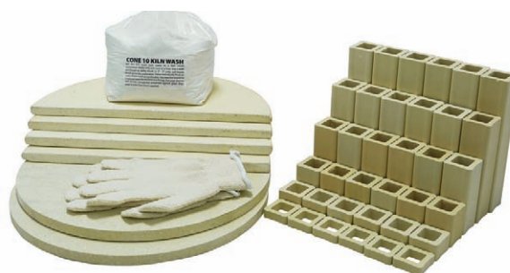
Furniture kit for a J18X.