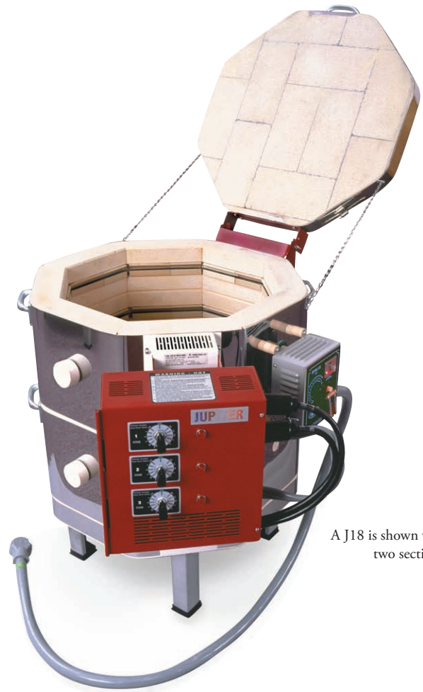
A J18 is shown with two sections.

UL Listing: c-MET-us listed to UL499 standards.